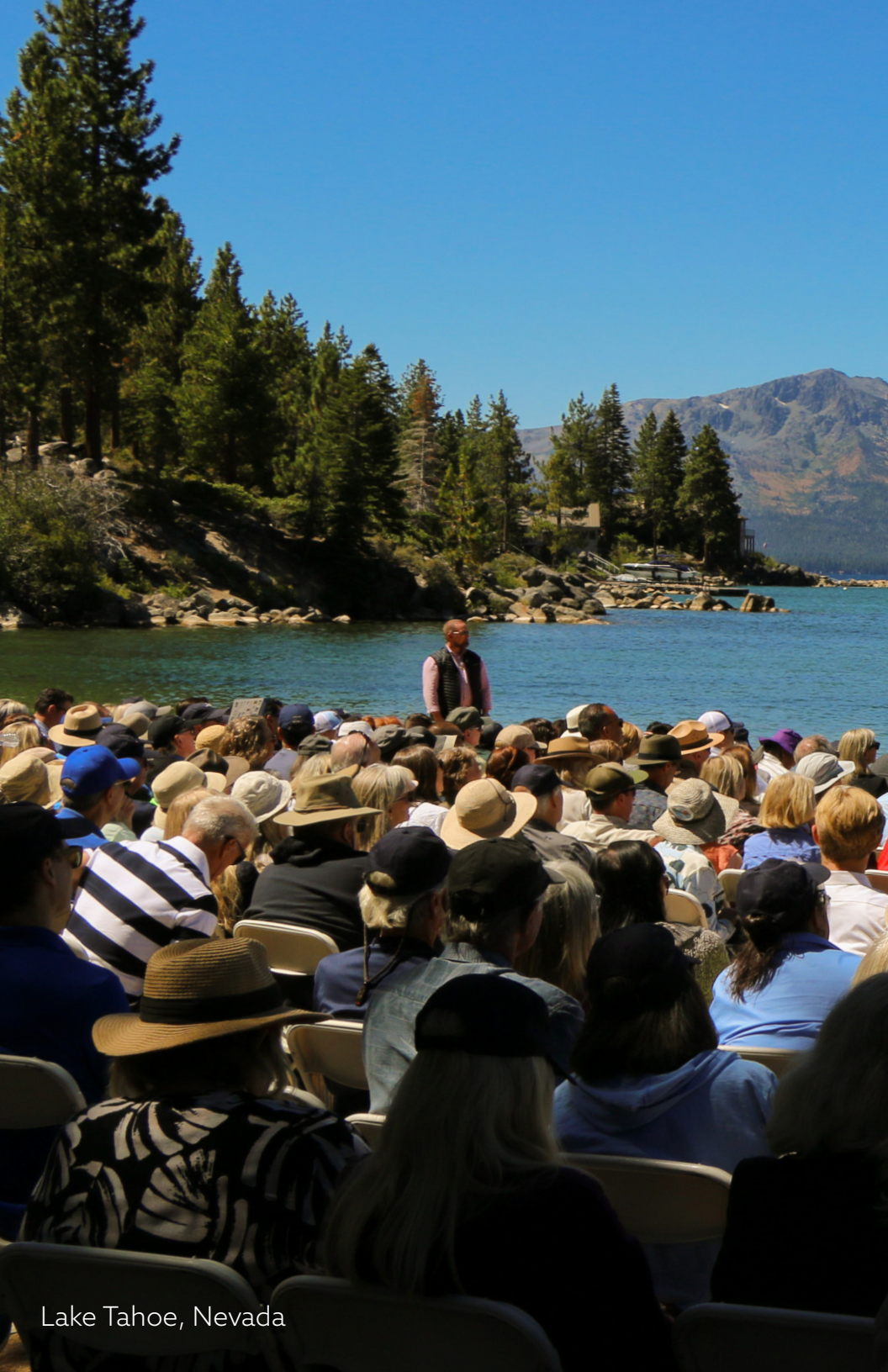
Lake Tahoe, Nevada