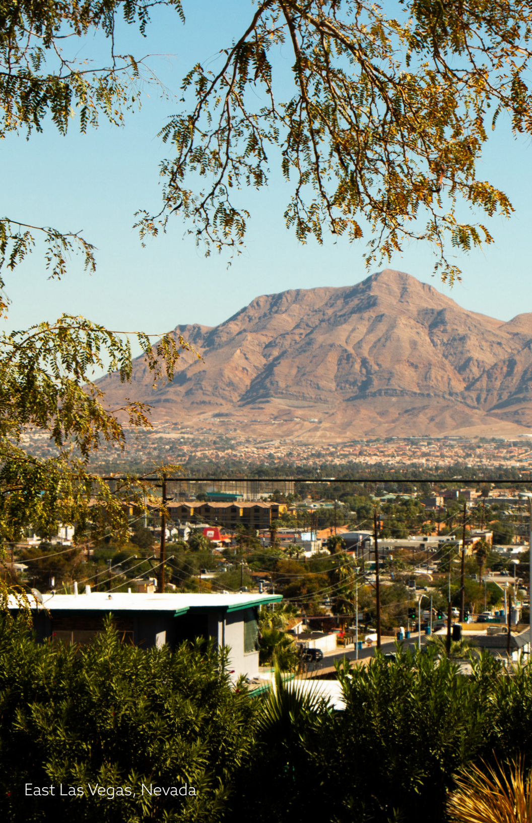
East Las Vegas, Nevada